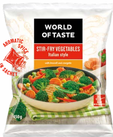
Stir-fry vegetables Italian style with broccoli and courgette 450 g

Ingredients: broccoli, carrot, green flat bean, corn, red bell pepper, courgette, herb spice.