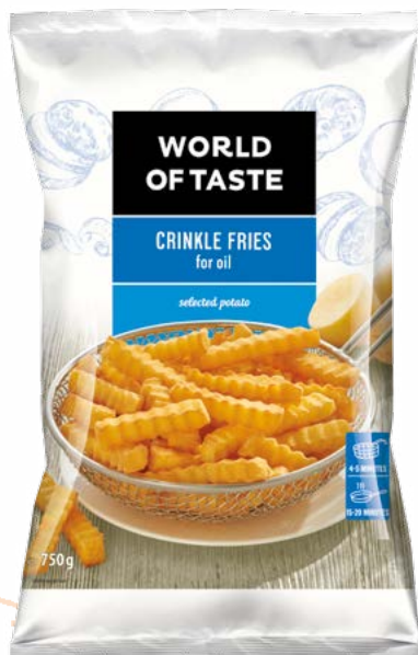
Crinkle fries for deep-frying 750 g