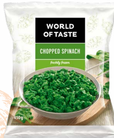
Chopped spinach 450 g