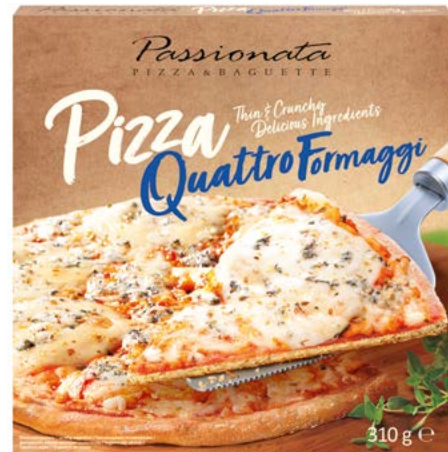
Pizza Quattro Formaggi 310 g