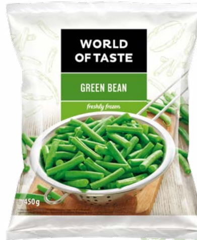
Green bean 450 g