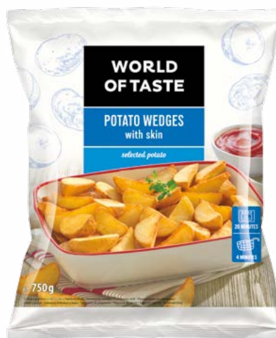
Potato wedges with skin 750 g