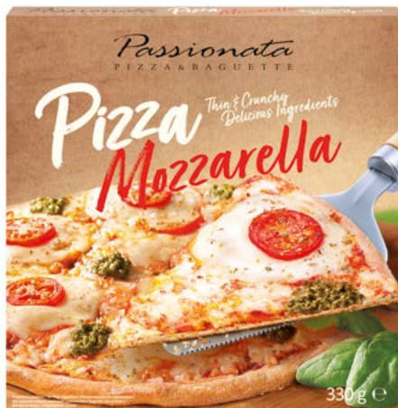
Pizza Mozzarella 330 g