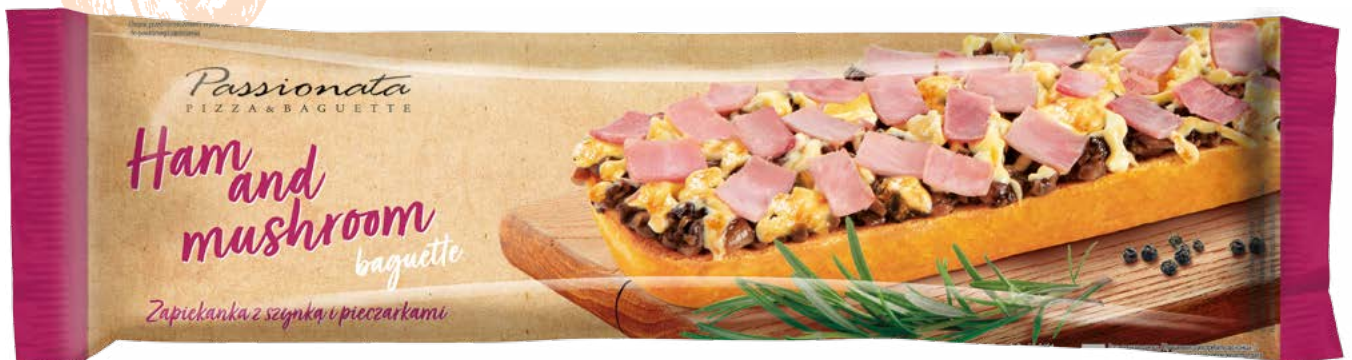
Ham and mushroom baguette 200 g