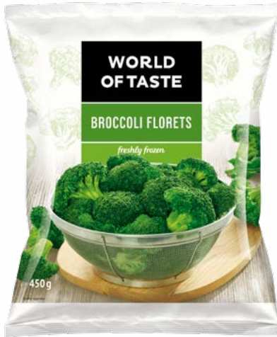
Broccoli florets 450 g