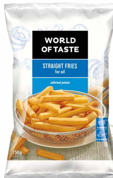
Straight fries for deep-frying 750 g, 1 kg