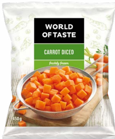
Carrot diced 450 g