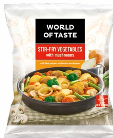
Stir-fry vegetables with mushroom 450 g

Ingredients: onion, green bean, carrot, mushroom, broccoli, pre-fried potato slices.