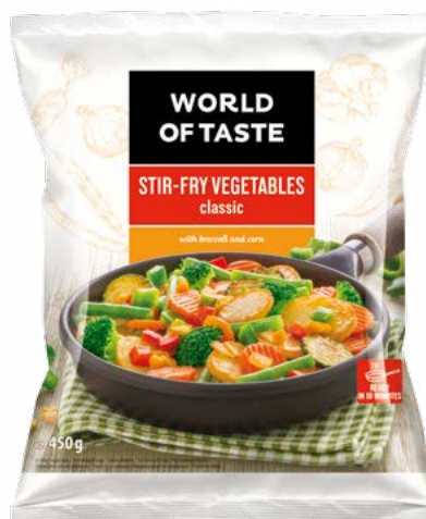
Stir-fry vegetables classic with broccoli and corn 450 g

Ingredients: broccoli, carrot, onion, green cut bean, corn, green bell pepper, red bell pepper, courgette, pre-fries onion slices.