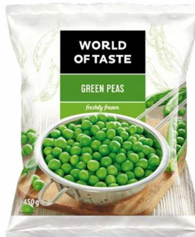
Green peas 450 g