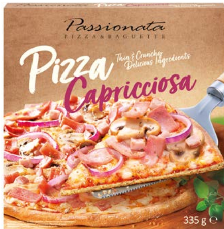
Pizza Capricciosa 335 g