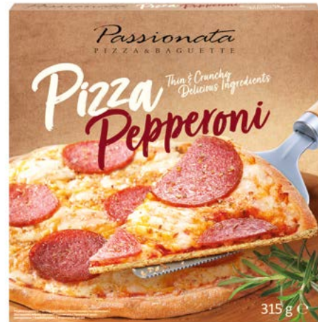
Pizza Pepperoni 315 g