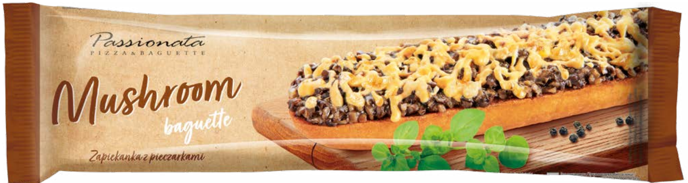
Mushroom baguette 200 g