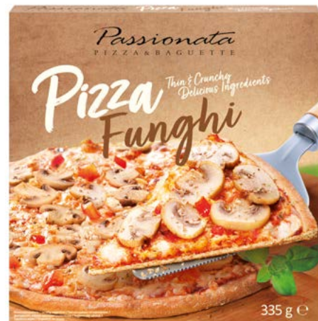
Pizza Funghi 335 g