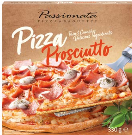
Pizza Prosciutto 330 g